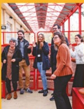
Talent & Happiness