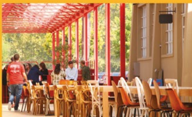
Community common spaces