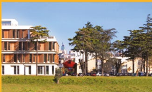
Taylor-made office spaces