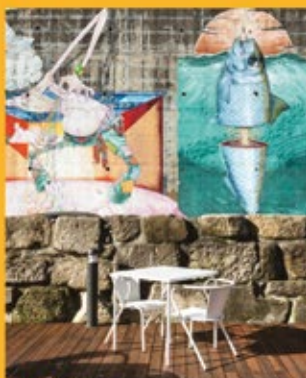
Art & Culture