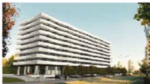
Icon Apartments concept image