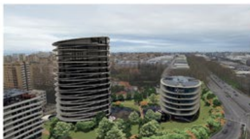
Icon Apartments, Icon Offices II and Offices I, respectively concept image